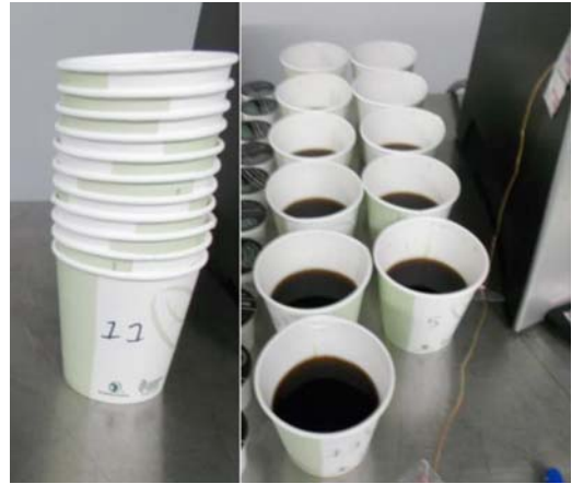
FIG. 5 Sample Test Cups for Single Cup (Type I) Brewer Heavy Use Brewing Energy Test