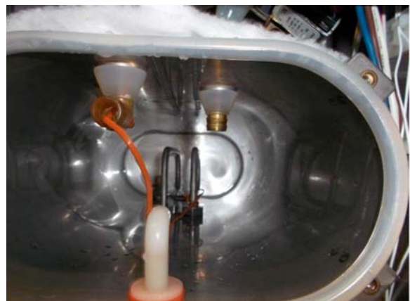
FIG. 1 Thermocouple Location for Monitoring Internal Water Tank Temperature

NOTE 7—It may be necessary to flush hot water tanks with incoming