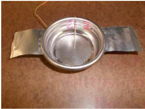
FIG. 3 Thermocouple Location in Portafilter for Monitoring Single Cup (Type I) Brewer Dispensing Temperature