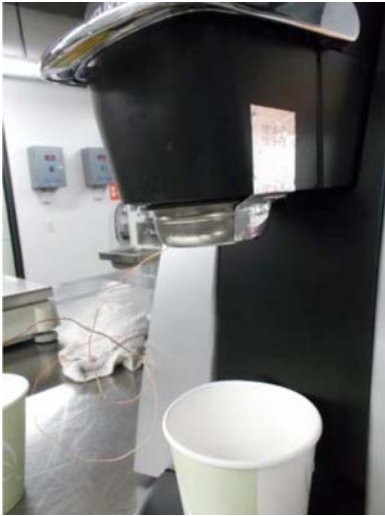
FIG. 2 Portafilter Installation on Single Cup (Type I) Brewer