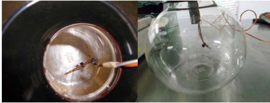
FIG. 6 Test Carafe Thermocouple Location for Batch (Type II) Brewer Heavy Use Brewing Energy Test

10.3.1 Determine whether the brewer requires preheating in order to achieve a ready-to-use state. Prior to testing, verify that the brewer and supplemental equipment has stabilized to an average temperature of 75 \pm 5^\circ\text{F} ( 24 \pm 3^\circ\text{C} ) before turning the coffee brewer on. If the brewer has an empty reservoir, the cold water temperature entering the brewer will be the initial temperature so long as it is within specified 70 \pm 5^\circ\text{F} ( 21 \pm 3^\circ\text{C} ). Otherwise, the ambient temperature will serve as the initial temperature.