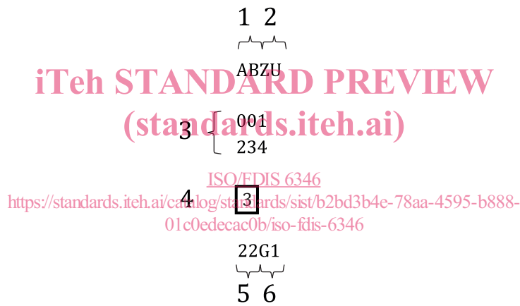
Figure 3 — Mandatory identification marks - Alternative (multiple column) vertical layout