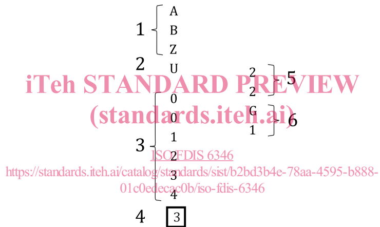
Figure 1 — Mandatory identification marks - preferred horizontal layout