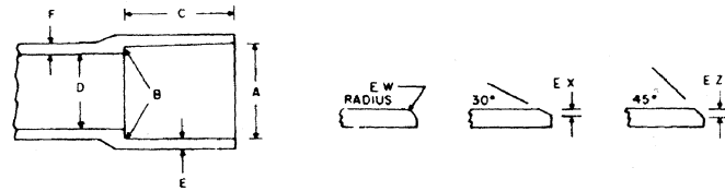
TABLE 1 Tapered Sockets for PVC Pipe Fittings, Schedule 80, in. (mm) A