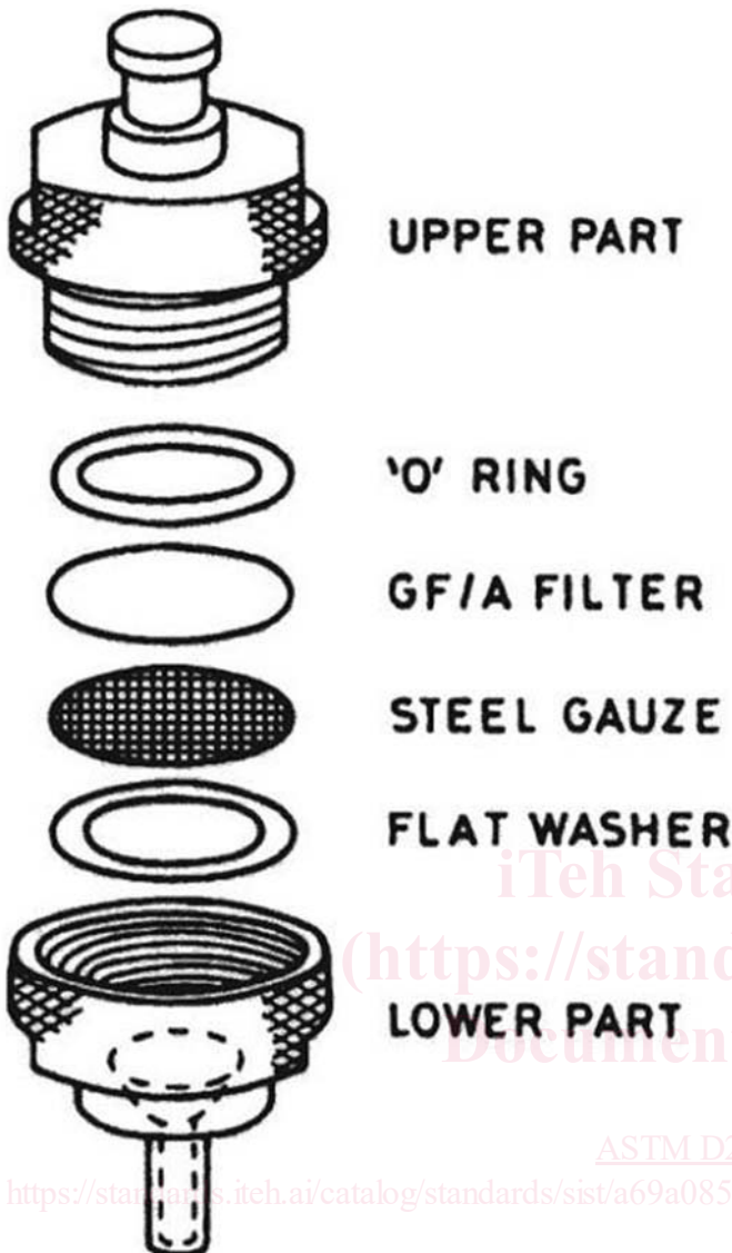
FIG. 1 Assembly of Filter A