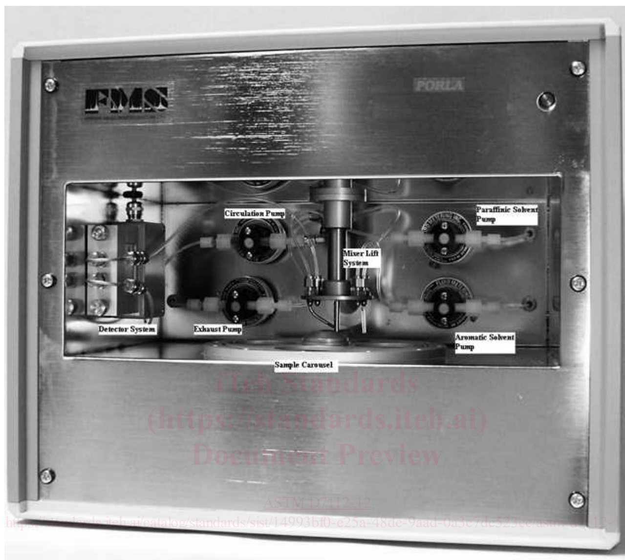
FIG. 1 PORLA Heavy and Crude Oil Stability and Compatibility Analyzer

specifications are available. 5 Other grades may be used, provided it is first determined that the reagents are of sufficiently high purity to permit their use without lessening the accuracy of the determination.