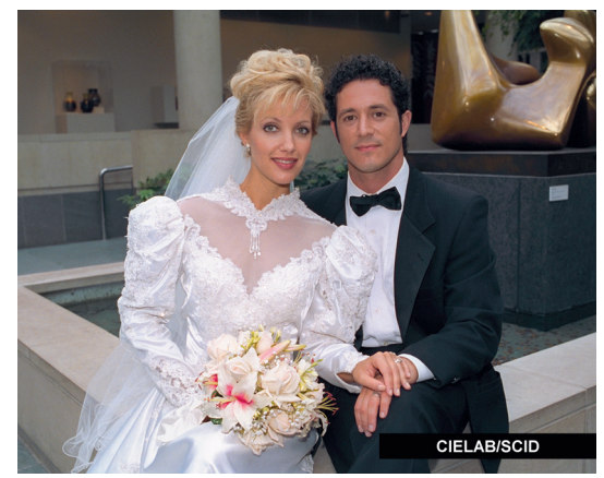
a) N1 Bride and groom