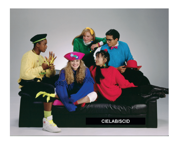
b) N2 People