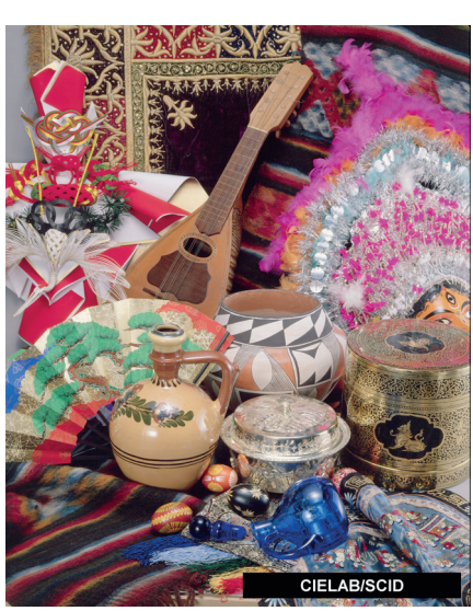
e) N5 Mandolin