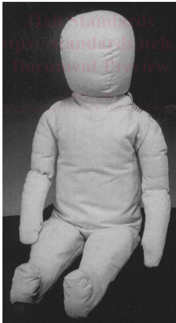
FIG. 1 CAMI Infant Dummy, Mark II 17.5 lb (7.9 kg)