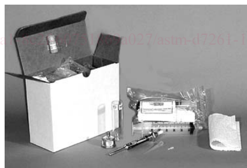
FIG. 4 Six Pack and Test Accessories

10.2 Open the case, and raise the right panel until completely vertical and locked in place.