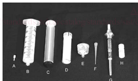
FIG. 3 Test Supplies and Small Parts