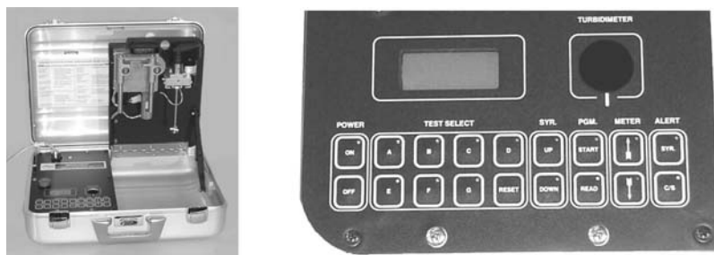
FIG. 1 Micro-Separometer Mark V Deluxe and Associated Control Panel

only the D push button is applicable to this test method.