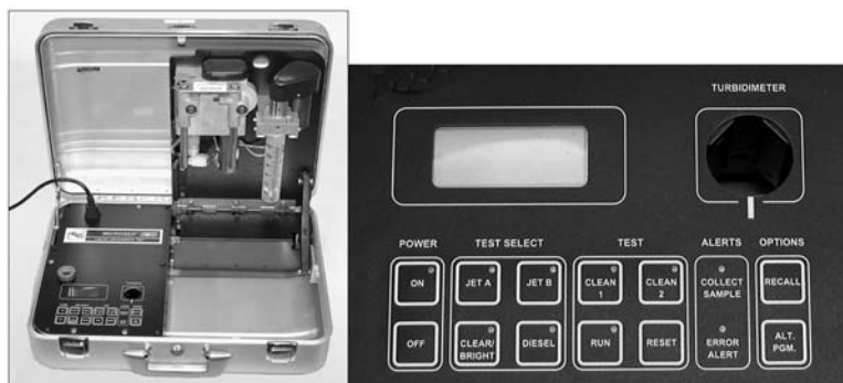
FIG. 2 Micro-Separometer Mark X and Control Panel