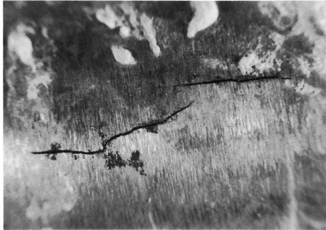
FIG. 2 Typical External Stress Corrosion Cracks (5x Magnification)