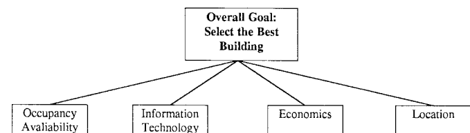
FIG. 1 An Example Hierarchy for the Problem of Selecting a Building

5.4.3 Include in the decision matrix and analysis only those attributes which the decision maker considers important and which vary significantly among one or more alternatives. For example, heating capacity is clearly an important attribute of any heating system, but if the alternatives in Table 1 include only systems which match the capacity requirements of the building in question, then capacity is not a distinguishing attribute and is not to be included in the decision matrix or in the MADA analysis.