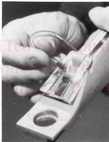
FIG. 2 Cleaning