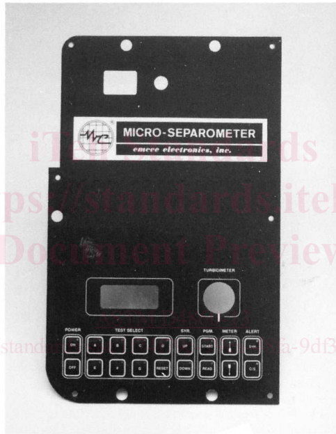
FIG. 1 Mark V Deluxe Micro-Separometer and Control Panel