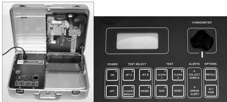
FIG. 2 Mark X Micro-Separometer and Control Panel

7.1.6 Test mode selection is accomplished by depressing the applicable push button—letter (C) on the Mark V and CLEAR/BRIGHT on the Mark X. The depressed push button illuminates and the sequential illumination of the other lettered push buttons ceases. The START push button on the Mark V and the RUN push button on the Mark X also illuminate and the syringe drive mechanism moves to the UP position.