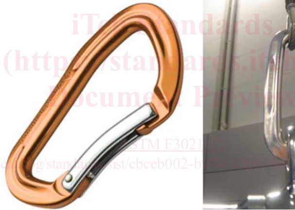
FIG. 4 Example of D-Shaped Carabiner

5.1.3.6 Assemblies that are intended to be adjusted by a mechanism shall function in a controlled manner and not free fall when being adjusted or when released, for example, there must be a mechanism that engages in the next available position when the adjustment is released.