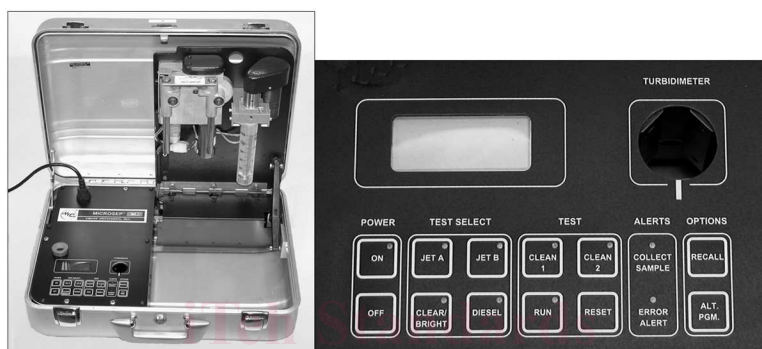
FIG. 2 Micro-Separometer Mark X and Associated Control Panel

6.2.7.1 Selection of Test Mode A or Test Mode B program is accomplished by depressing either the Jet A or Jet B lettered pushbutton. The depressed pushbutton illuminates and the sequential illumination of the other lettered pushbuttons ceases. The CLEAN 1 pushbutton also illuminates.