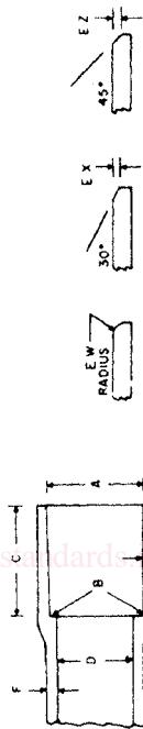
TABLE 1 Tapered Sockets for PVC Pipe Fittings, Schedule 80, in. (mm) A