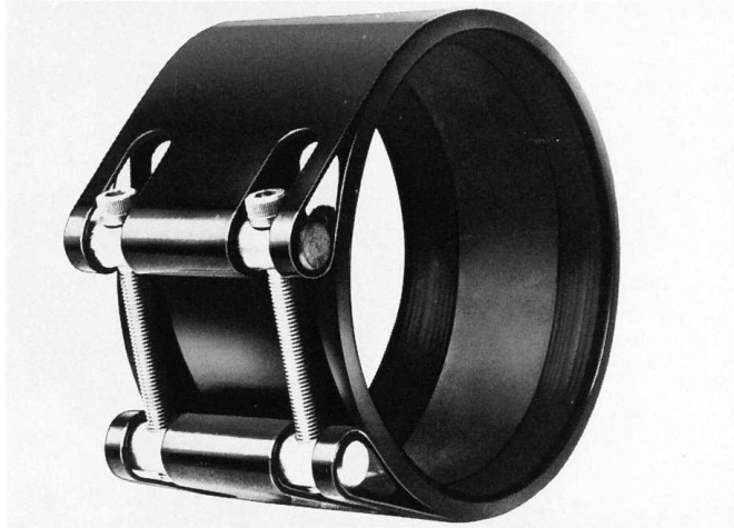
FIG. 3 Type II—Class 2 Typical Construction

3.1.18 specimen —a prepared assembly consisting of the test joint including GMC and pipes or fittings. The specimen is placed into a controlled environment and tested to determine if the joint performs to the standards established by the test.