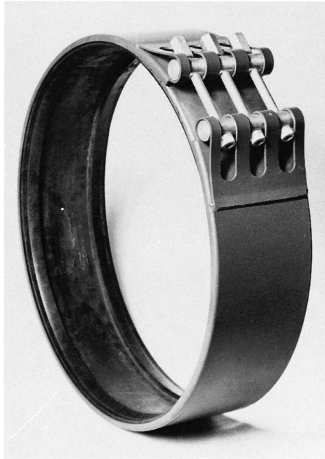
FIG. 4 Type II—Class 3 Typical Construction