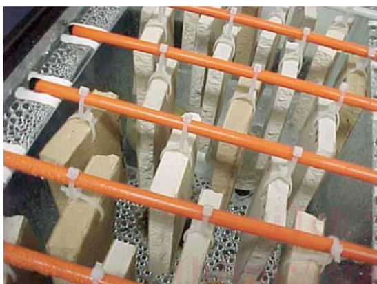
FIG. 3 Cable Ties used to Hang Test Specimens from Rods Inside of the Environmental Chamber