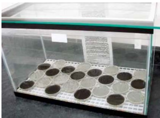
FIG. 2 Typical Environment Chamber Set Up