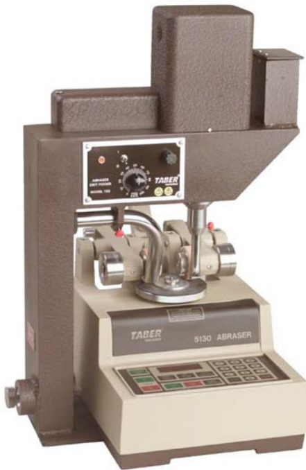
FIG. 1 Taber Abraser with Grit Feeder

4.3 This test method is designed to simulate one kind of abrasive action and abradant that a flooring may encounter in the field. However, results should not be used as an absolute index of ultimate life because, as noted, there are too many factors and interactions to consider. Also involved are the many different types of service locations. Therefore, the data from this test method are of value chiefly in the development of materials and should not be used without qualifications as a basis for commercial comparisons.