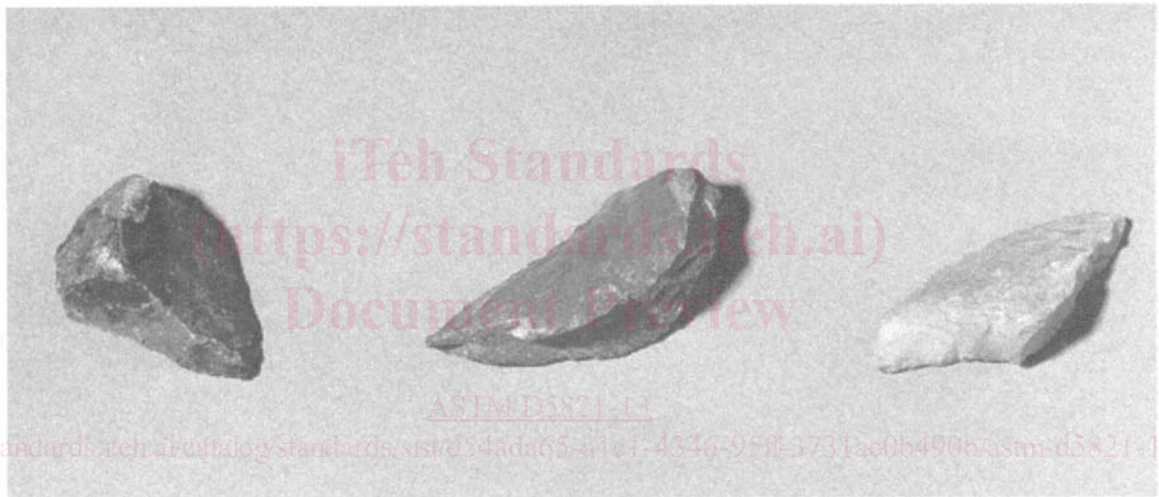
FIG. 3 Fractured Particle (Sharp Edges, Smooth Surfaces)

with two or more fractured faces), repeat the procedure on the same sample for each requirement.