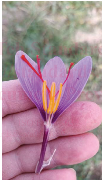
Figure 3 — Crocus sativus L. saffron flower (longitudinal cut)