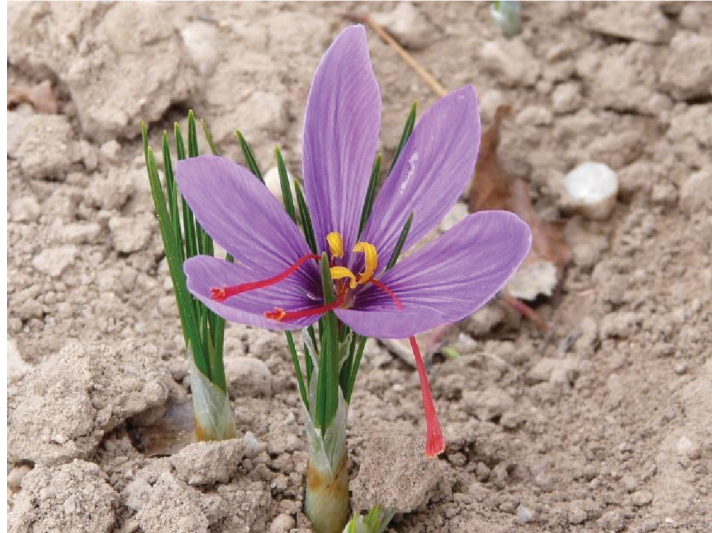
Figure 2 — Crocus sativus L. flowers in farm