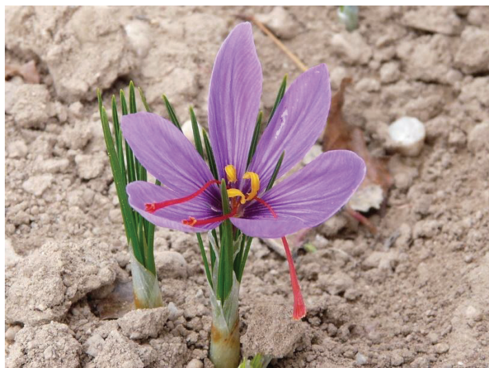
Figure 2 — Crocus sativus L. flowers in farm