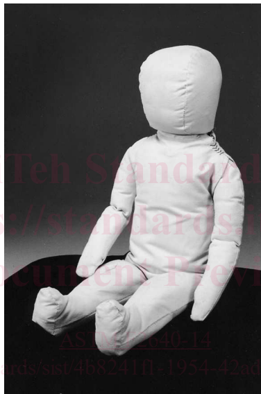
FIG. 2 CAMI Infant Dummy Mark II

6.4.2 The child restraint system shall include both waist and crotch restraint designed such that the use of the crotch restraint is mandatory when the restraint system is in use.