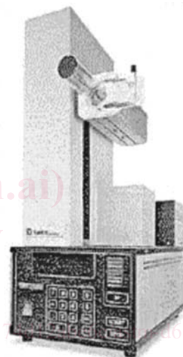
FIG. 2 Picture of Apparatus

interface, cooling/heating block assembly with cylindrical jacket with an inside diameter of 44.2 to 45.8 mm, and about 115 mm in depth to accept the test jar) robotic mechanisms for lifting, tilting, replacing the test jar, optical camera system, and a temperature measuring device.