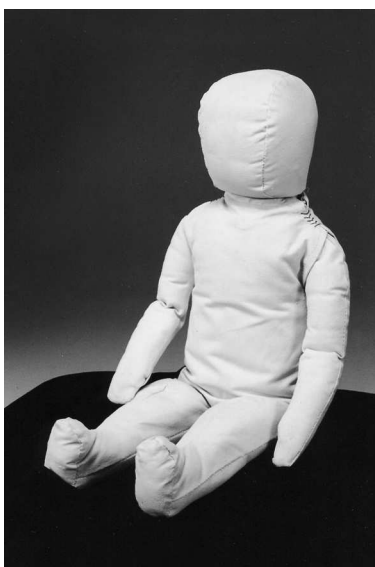
FIG. 1 CAMI Dummy, Mark II