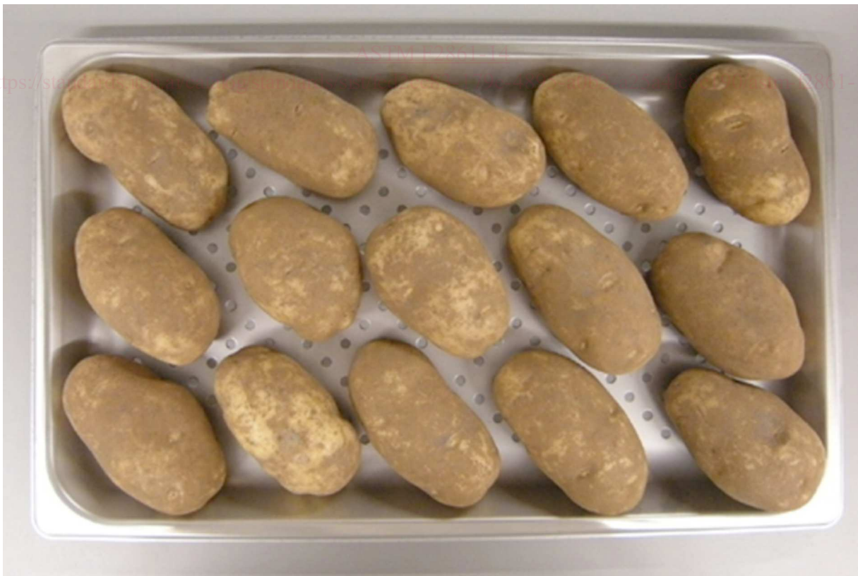
FIG. 3 Russet Potato Load

10.7.4 Prepare a minimum number of loads for three test runs. Place 15 russet potatoes (7.3) (three rows of five potatoes per row) on each pan (Fig. 3). The weight of the potatoes on these pans shall be 7.25 \pm 0.30 lb ( 3.3 \pm 0.14 kg). For two-thirds size (Capacity C) combination ovens, load each