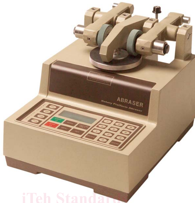
FIG. 1 Rotary Platform Double Head Abrader

6.1.3 Motor capable of rotating the platform and specimen at a speed of 72 \pm 2 r/min.