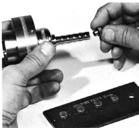
FIG. 4 Inserting a Typical Orifice