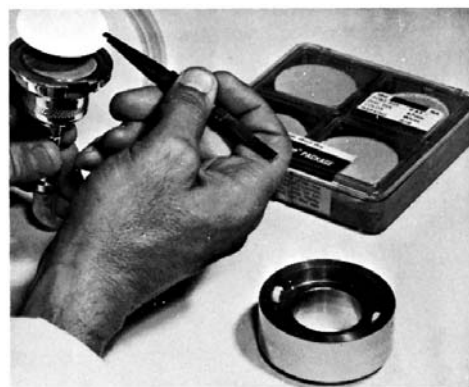
FIG. 5 Placing the Filter on a Typical Screen Support

may be connected to the flowmeter. If a flowmeter is used between the filter holder and vacuum source, correction to the standard temperature and pressure must be made to determine actual standard temperature and pressure flow.