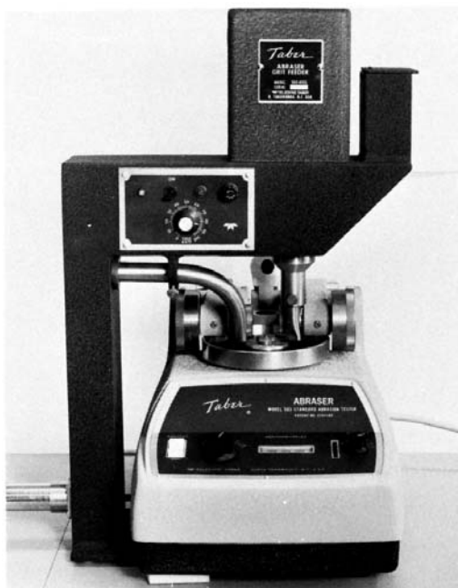
FIG. 1 Taber Abraser with Grit Feeder

affected by many factors. One of these is the physical properties of the material in the floor covering surface, particularly its hardness and resilience. The type and degree of added substances, such as fillers and pigments, can also affect abrasion resistance. It can also be affected by conditions of the test (for example, the type and characteristics of the abrasant and how it acts on the area of the specimen being abraded, including the development and dissipation of heat during the test cycle). The surface characteristics of the specimen, such as type, depth, and amount of embossing, can likewise affect the abrasion resistance of resilient floorings.