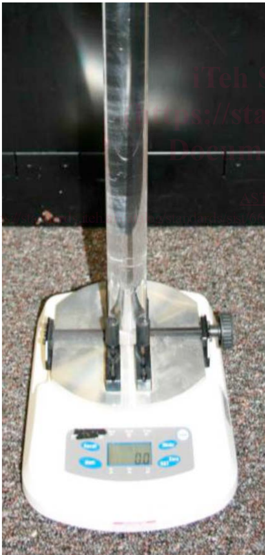
FIG. 1 Acrylic Rod Attached to a Torque Meter