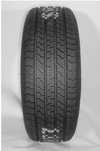
FIG. 1 Front View of the P225/60R16 97S Radial Standard Reference Test Tire