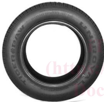
FIG. 2 Side View of the P225/60R16 97S Radial Standard Reference Test Tire