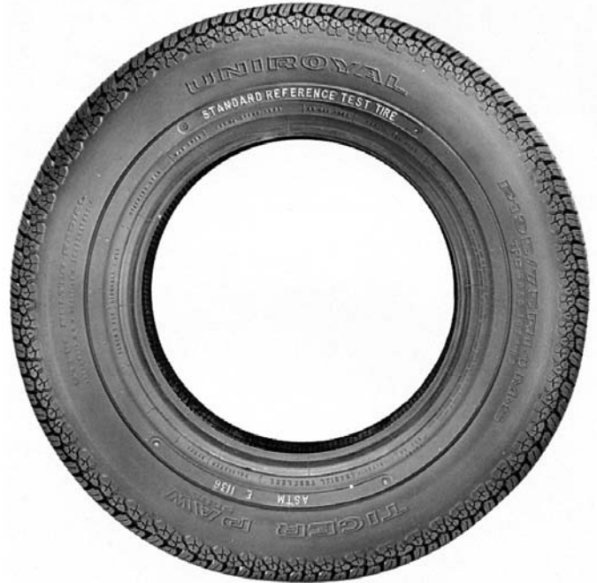
FIG. 2 Side View of the P195/75R14 Radial Standard Reference Test Tire

“Standard Reference Test Tire,” and ECE (Economic Commission for Europe) and DOT (Department of Transportation) certification marks.