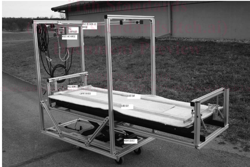
FIG. 2 Cleaning Bed Apparatus

5.14 Rotating Agitator Conditioning Vacuum Cleaner/Equipment or a Central Vacuum Cleaning System equipped with a powered, rotating agitator-equipped nozzle, for conditioning new test carpets and removing residual dirt from the test carpet before each test run. This cannot be the unit tested.