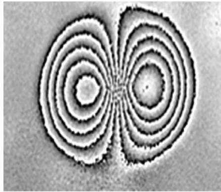
FIG. 34 A phase map shearogram with horizontal shear vector yields a fringe pattern showing the first derivative of the out-of-plane deformation, \partial w / \partial x . Using an unwrapping algorithm, the image at right shows the positive (white) and negative (black) slope change.