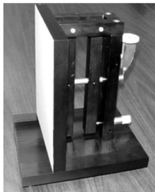
FIG. 93 A shearography camera calibration device consists of a means to apply a known deformation to an aluminum flat plate. The flat surface deformation is imaged. This device allows verification of the shearography camera operation, laser stability, and the minimum coherence length.

4.4.1 Inspection results can be kept as a permanent record and available for future evaluation and presentation. With some software, the data can be stored as a JPG, TIF, or other image format. The format, and the raw data is stored and can be processed and evaluated at any time. Shearography systems utilize tools such as video calipers to allow for rapid defect sizing and area measurement.