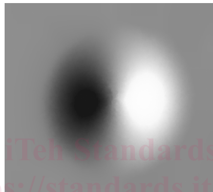
FIG. 45 An unwrapped phase map plots the test part surface deformation derivative without fringes.

4.4.2 Shearography has been used with excellent results for filament-wound pressure vessels, composite and metal face sheet sandwich panels with both honeycomb and foam cores, solid monolithic composite laminates, foam cryogenic fuel tank insulation, bonded cork insulation, aircraft tires, and elastomeric and plastic coatings. Frequently, defects at multiple and far side bond lines can be detected.