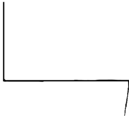
FIG. 3 With Riser