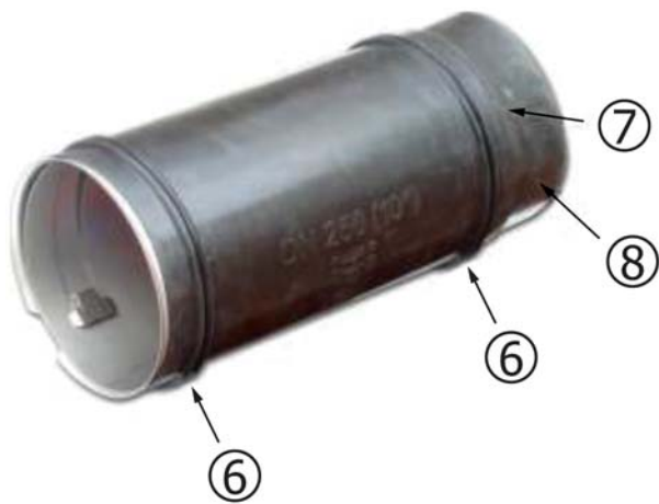
FIG. 2 Locking Gear Mechanism and EPDM Rubber Seals

5.2.3 Projecting Rubber End —The projecting rubber end acts as a seal between sleeves installed in series, (8) in Fig. 2 and Fig. 3.