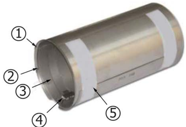
FIG. 1 Stainless Steel Sleeve

5.2.2 Trimming Line —There is a trimming line marked in the rubber jacket. It shows the installer where to cut off the projecting rubber end (when a single sleeve is installed), (7) in Fig. 2.