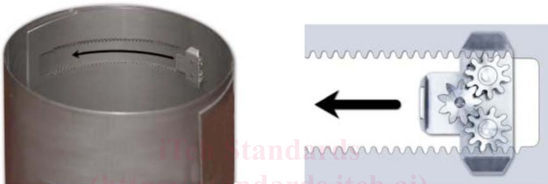
FIG. 4 Locking Gear Mechanism

installations, followed by one end-flared sleeves. The both ends flared type is used for single installations only.