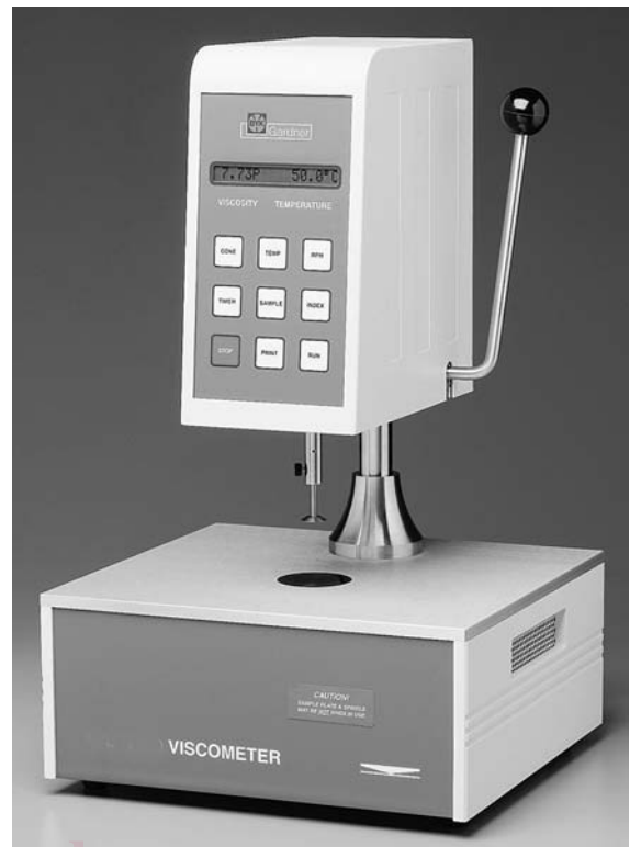
FIG. 2 Digital Cone and Plate Viscometer

8.2 Verify the calibration of the apparatus by following the procedure in Section 9, but using standard refined mineral oils having Newtonian characteristics and known viscosities. If the viscometer reads the correct viscosity (or within 5 % of that value) with two or more oils whose viscosities bracket those of specimens to be tested, then the viscometer readings may be used as is. If the viscometer readings do not give the correct viscosities for the oils, then a calibration curve must be constructed by taking viscometer readings for three oils and plotting measured viscosity versus specified (correct) viscosity for the oils. Subsequent measurements are corrected to true viscosities through use of the curve.