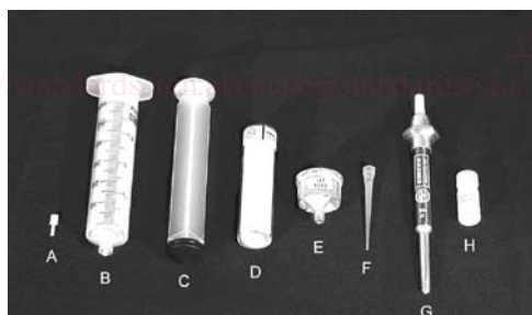
FIG. 3 Test Supplies and Small Parts