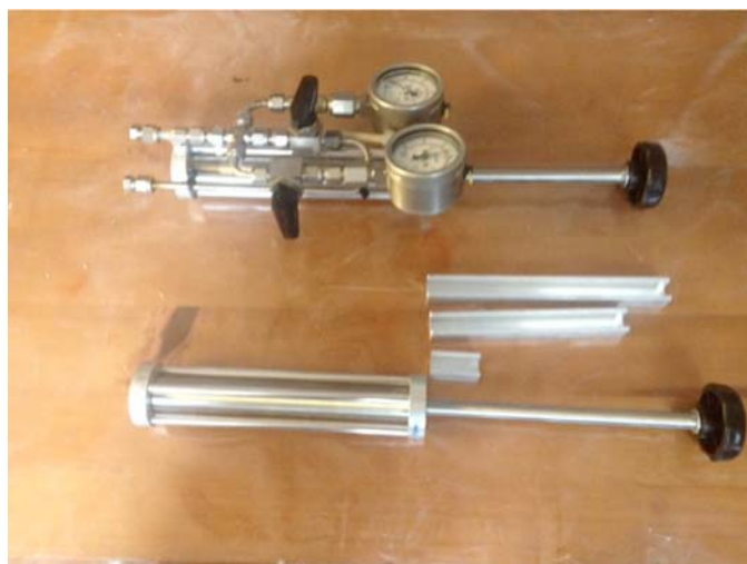
FIG. 1 Field Test Apparatus

Gauge scales will read -100 kPa to 100 kPa but the overall operating range is 200 kPa.