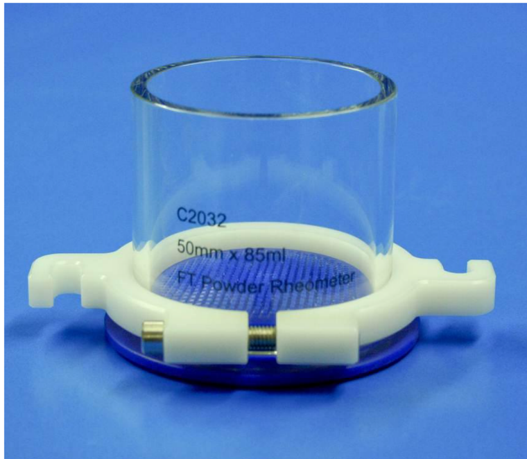
FIG. 6 Fitting the Serrated Base