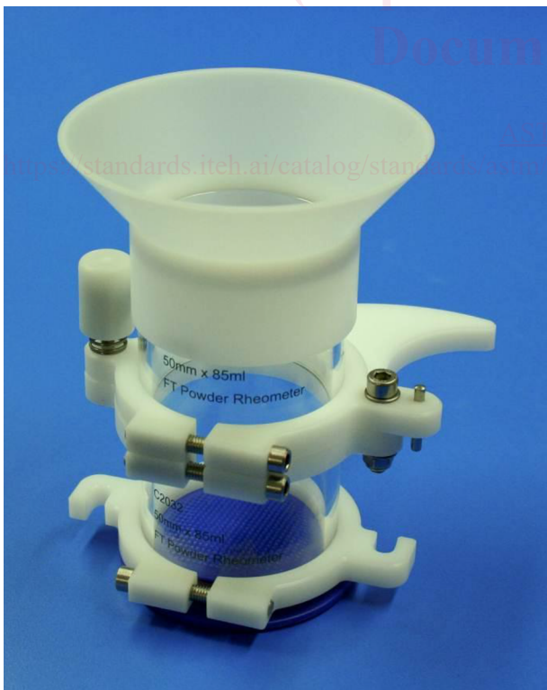
FIG. 2 Shear Cell Vessel

operation of the 10-mL shear cell is identical to that described herein for the 85-mL shear cell but using a smaller shear cell and range of attachments. The limit on the maximum particle size is commensurately reduced to a maximum particle size of 0.5 mm. The 1-mL shear cell uses a significantly different cell design and attachments, which is beyond the scope of this standard.