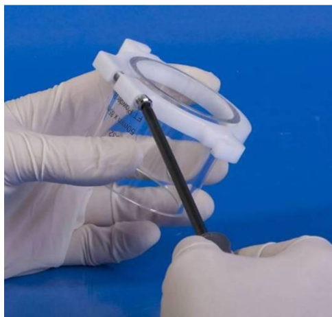
FIG. 5 Fitting the Clamp Ring

7.7 Carefully invert the glass cylinder, clamp ring, serrated base and leveling assembly and place on the edge of a flat surface (Fig. 7) so that the glass cylinder can be fitted flush with the inner face of the leveling assembly without impediment from the upper part of the leveling assembly.