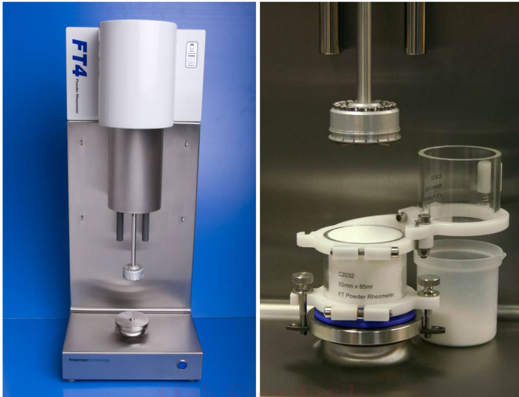
FIG. 1 FT4 Powder Rheometer (The left hand image shows the instrument with the shear head fitted; the right hand image shows the shear head and shear cell vessel.)