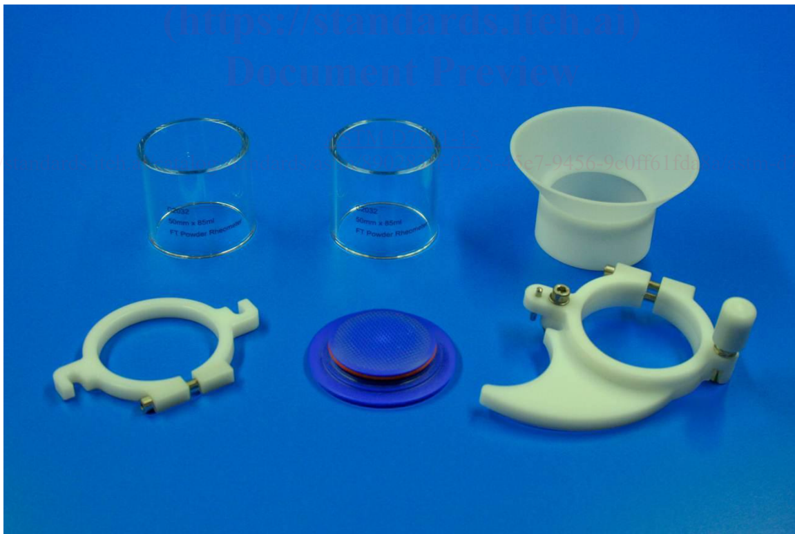
FIG. 4 Components Required to Assemble the 50-mm x 85-mL Shear Cell Vessel

7.5 Locate the serrated base into the glass cylinder adjacent to the clamp ring. Carefully rotate the serrated base to make sure that the entire circumference is in contact with the glass cylinder (Fig. 6).