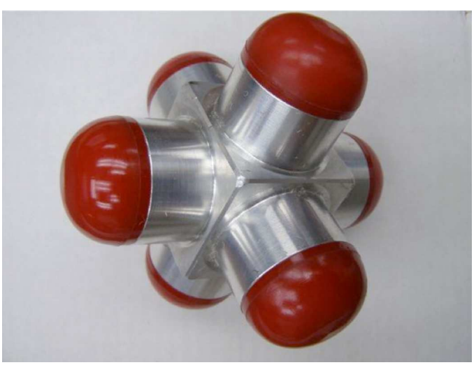
FIG. 4 2.8 lb Residential Hexapod Tumbler