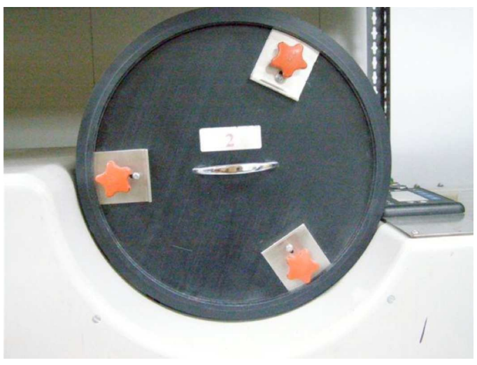
FIG. 1 Typical Front View of Drum Cover

Diameter of Foot 1.60 \pm 0.04 in. (40 \pm 1 \text{ mm}) 0.60 ± 0.04 in. Height of Foot (15 \pm 1 \text{ mm}) Edge of Radius Stud 0.60 \pm 0.04 in. (15 \pm 1 \text{ mm}) Steel Backing for Polyurethane Foot Hardness 8.3 ± 6 Type A Durometer Foot Thickness (3.00 \pm 0.25 \text{ mm}) 0.12 + 0.01 in Threading for 0.75 in. Metric M8 - 1.25 (typical) Bolt to attach Foot to Tumbler