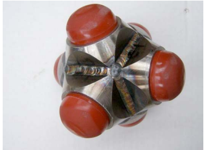
FIG. 3 8.4 lb Commercial Hexapod Tumbler