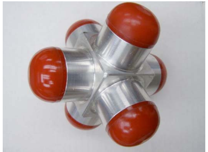
FIG. 4 2.8 lb Residential Hexapod Tumbler

6.4 Vacuum Cleaner —Each specimen shall be vacuumed and pile erected with a hand-held vacuum that meets the following general specifications: powered rotating brush, bag less design, HEPA filtration, 7 A motor, nozzle width 6.5 \pm 0.3