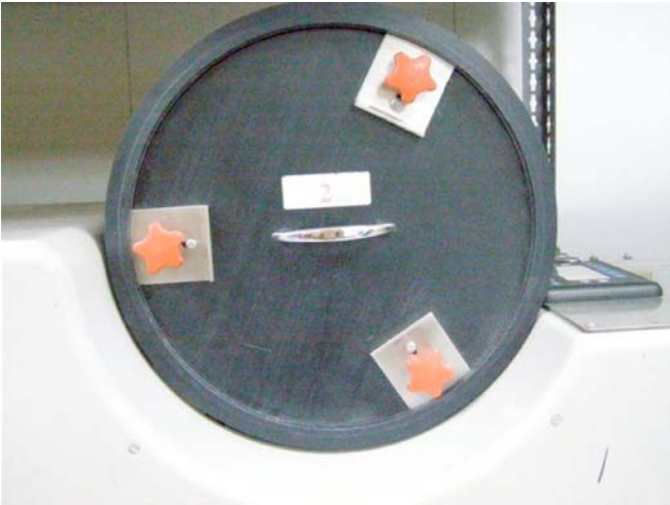
FIG. 1 Typical Front View of Drum Cover