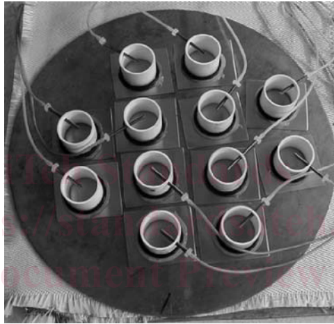
FIG. 4 Test Cells on Hot Plate

https://standards.iteh.ai/catalog/standards/sist/3db84e87-8e9a-49fc-80bd-b7ef3074a7b2/astm-c1617-15