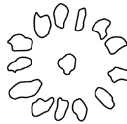
FIG. 2 Typical Injector Spray Pattern

10.3.14 Crankcase Internal Pressure —As mentioned by a gauge or manometer connected to an opening to the inside of the crankcase through a snubber orifice to minimize pulsations, the pressure shall be less than zero (a vacuum) and typically