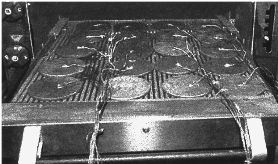
FIG. 2 Thermocouple Disk Placement

NOTE 9—Research at the Food Service Technology Center has determined that an overfired broiler is ready to cook when the broiler has reached a temperature of 700°F.