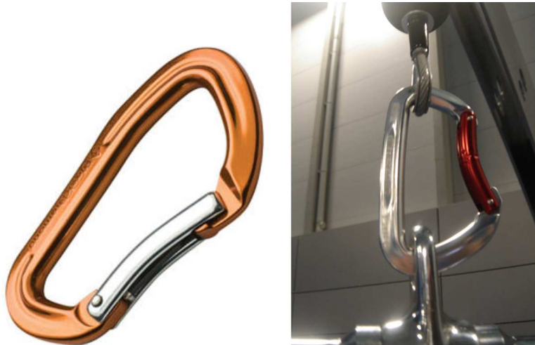
FIG. 4 Example of D-Shaped Carabiner

5.1.3.7 Detachable controls and adjustments shall be tethered where structure permits without interfering with access, egress, or performance of the exercise or have a storage position on the framework of the equipment.