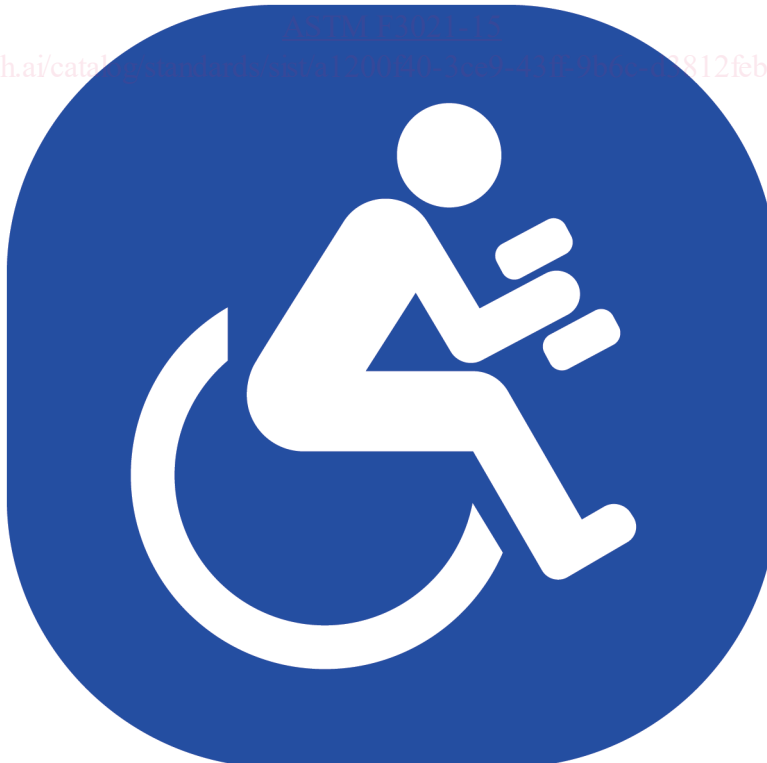
FIG. 5 Inclusive Fitness Symbol

(2) The inclusive fitness symbol shall be white in color with a blue background, and the blue and white shall have significant color contrast.