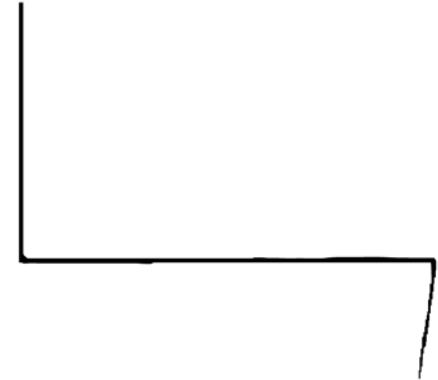
FIG. 3 With Riser