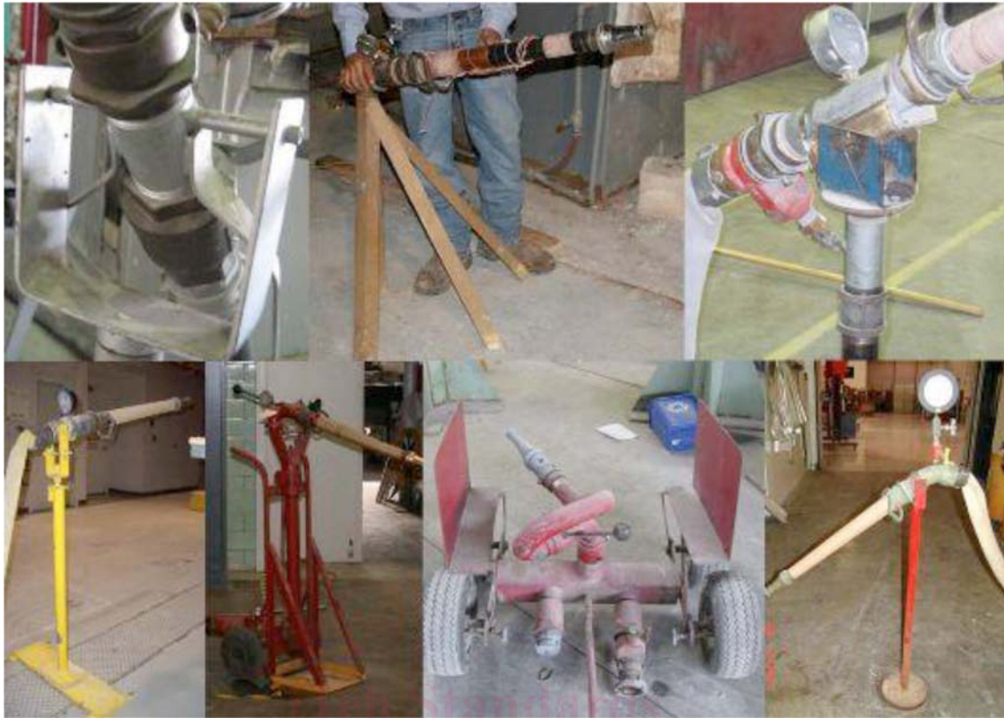
FIG. 2 Typical Hose Mounting Methods