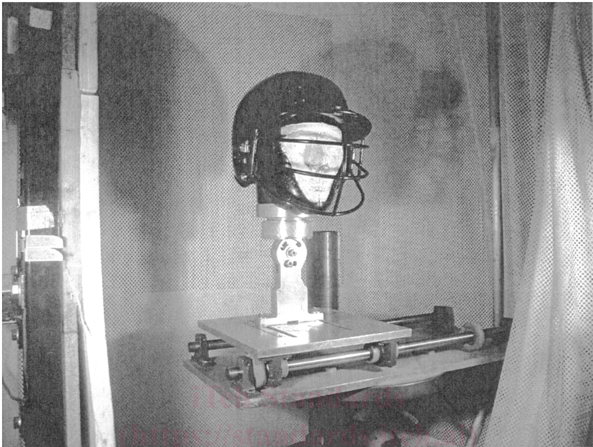
FIG. 1 Face Guard and Helmet on Headform