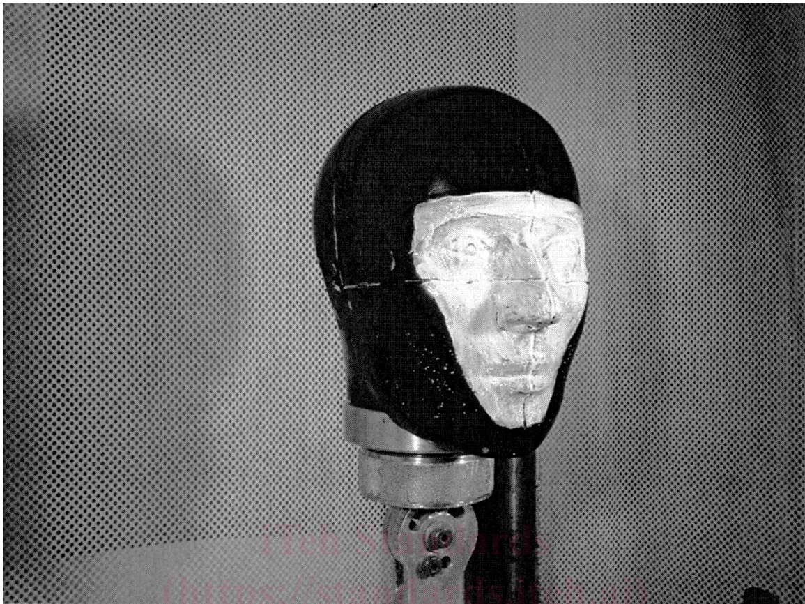
FIG. 3 Headform with Pressure Indicator Paste on Facial Area