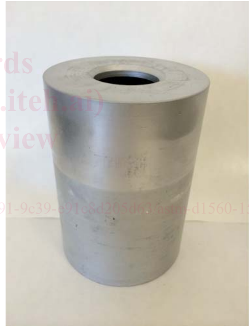
FIG. 4 Specimen Follower