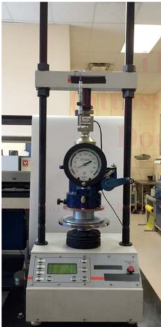
FIG. 3 Hvem Stabilometer Placed in the Testing Machine