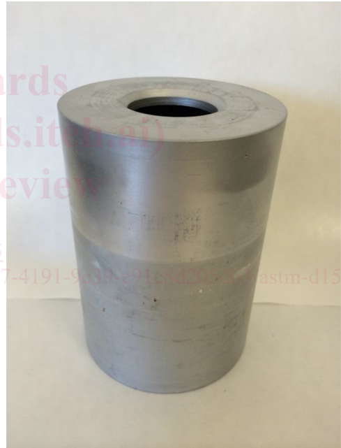
FIG. 4 Specimen Follower