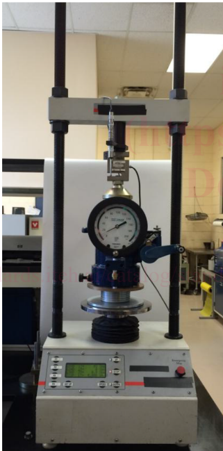
FIG. 3 Hvem Stabilometer Placed in the Testing Machine